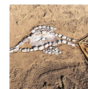
Beach art examples