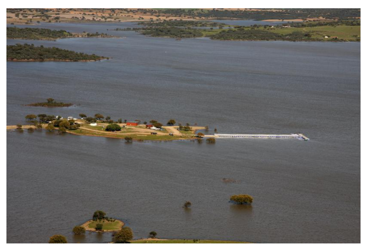
Race Office (Centro Náutico Reguengos de Monsaraz) and Camping area.