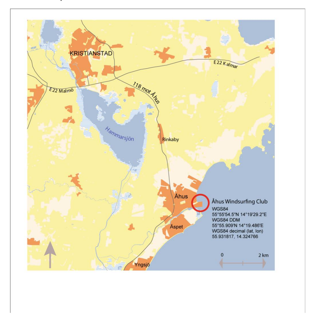
Map 2. Directions and GPS coordinates