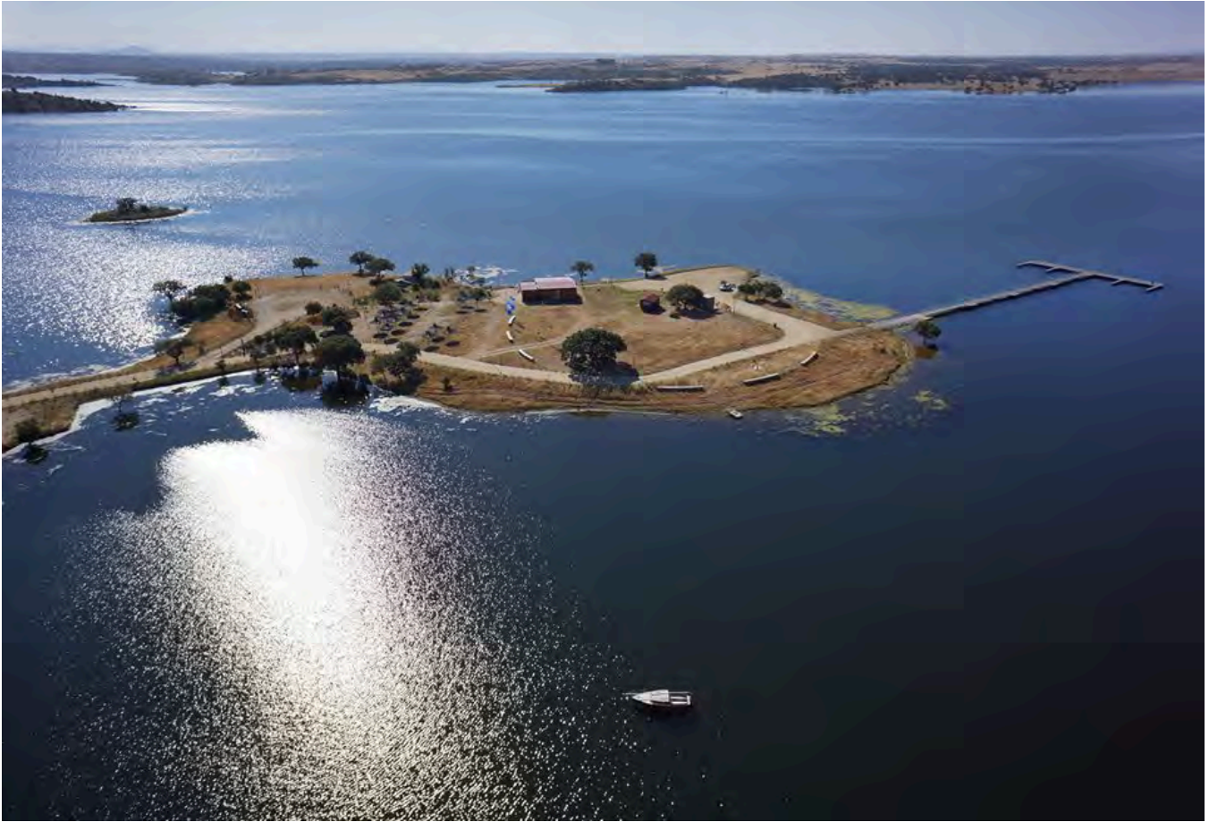
Race Office (Centro Náutico Reguengos de Monsaraz) and Camping area.